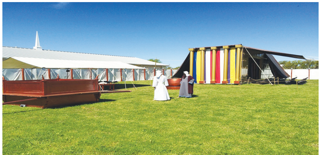
Messiah's Mansion coming to Anchorage September 2019