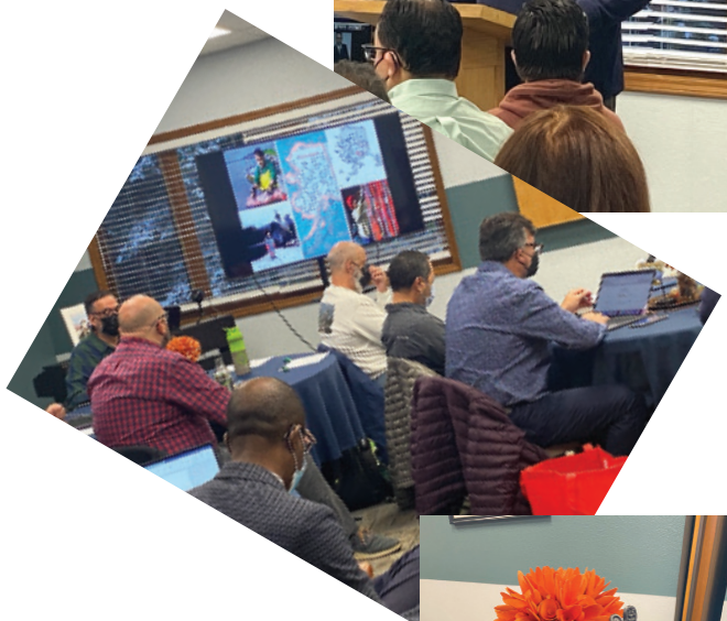
Above: Attendees learn about the challenges of ministry in Alaska