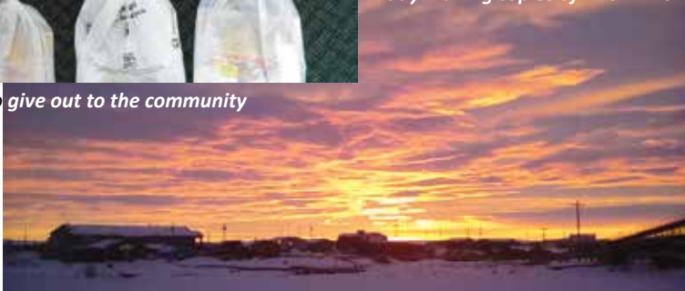
The sun rises over the village of Selawik