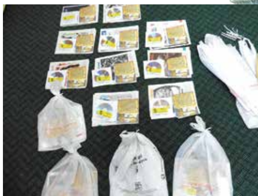
DVDs ready to give out to the community