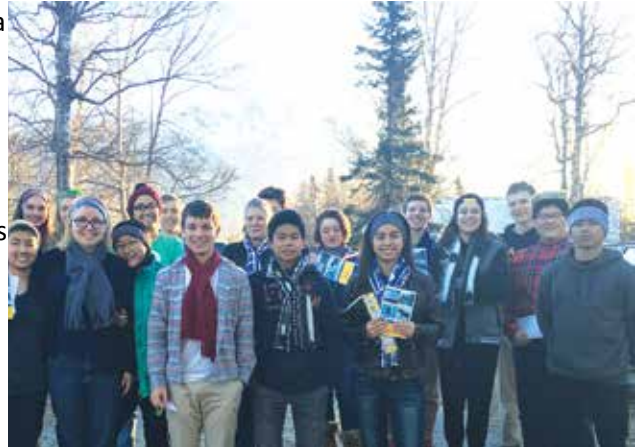
Weimar Academy Participants visit Alaska

was a non-SDA school), served breakfast at Beans Café in downtown Anchorage, assisted a church family in Talkeetna with various ranch chores, helped clean and spruce up the Talkeetna Church, performed the entire Sabbath services for two Sabbaths in a row at both Eagle River and Wasilla SDA churches, and