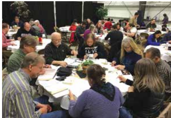
Seminar attendees gather for an evening of study and prayer

The room was filled with both members and non-members. There were times that you could 'hear a pin drop' because of the seriousness of the issue at hand. Certainly, the Enemy was active from time to time, but the prayers of the people were answered. It was exciting! And the prayers of the saints prevailed.