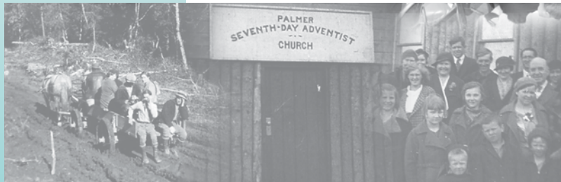
Early Alaskan Adventists from the Matanuska Valley Area

Since then, these annual gatherings have become a place of renewal, spiritual growth and precious fellowship for Adventist church members. Why not come this year? You will be richly blessed.