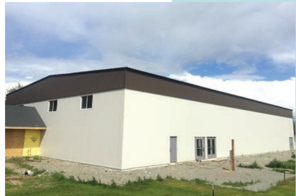
AGA's New Gym

our school. As for our staff – we give thanks continually as we see how God has led us and are eagerly looking forward seeing what he has in store for the future. Please continue to pray for us as we strive to educate students for this life and the life to come.