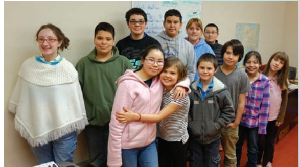
DAS Upper Grade Students

Known in town as “the seven-day school”, it has a very positive reputation within the community. Rather than being a cloistered school, serving only its church families, DAS is opening its doors to serve the general community as it serves God.