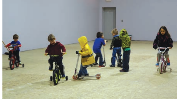
The DAS gym being put to good use!

DAS also enjoys a new gym for student activities and community events. The multi-purpose room in the school was the judging center for the baking competition for the week-long Beaver Round-Up celebration. The school and the local SDA church are built next to each other. The church is very accommodating and open to the community for weddings and funerals.