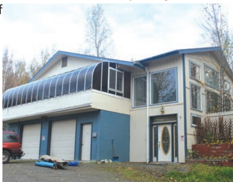
Greater Works Living Center