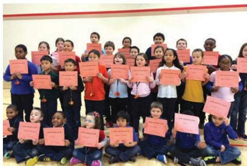
AJA's Jump for Heart Participants

"high-waters" mark this year. Donors were "double dutching", and put up a "red hot peppers" fight to outdo last year. The initial goal of $1200.00 was "bluebelled, cockle shelled, eevy, ively, OVERED" by a whopping $3,542.50. Thanks students, staff, and donors for jumping at the chance to save over 100 lives.